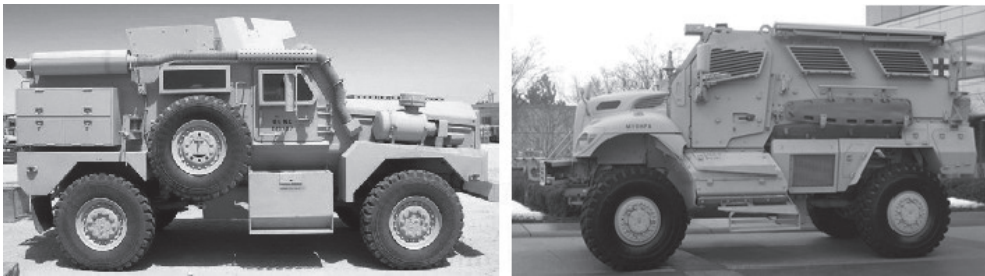
Picture 6. Navistar Maxxpro and Force Protection Cougar type MRAP vehicles. [24] [25]

Using a Mine Resistant Ambush Protected (MRAP) vehicle might seem obvious for securing the location at endangered areas or areas struck by a terror attack or disaster.