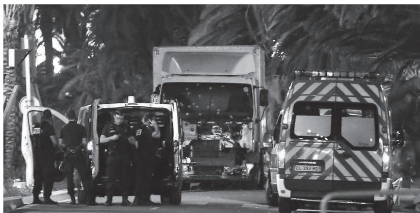
Picture 4. Police and Ambulance at the site of the tragedy in Nice. [22]

The attacker was a man of Tunisian origin from Nice who was shot by the police. It is still unknown whether he had any allies. A large amount of ammunition and weapons were found in the vehicle he drove, on the plateau of the truck.