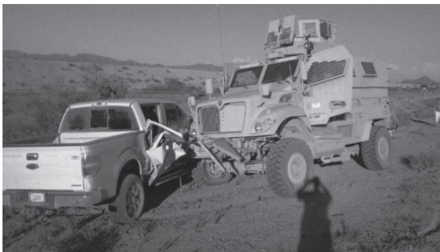
Picture 9. Accident caused by an inexperienced police officer with an MRAP vehicle. [35]

In Hungary the conditions of road usage need to be taken into consideration when applying the vehicles. Decree Nr. 36/2017. (IX. 18.) issued by the Ministry of National Development contains the data applicable to vehicles equipped with tires. “The material scope of the regulation comprises the transport of vehicles and combinations of vehicles exceeding the allowed total mass, axle load, tandem axle (axle group) load and size (hereinafter referred to as overweight or oversized vehicles) on national roads, on local roads and by state or local government owned not enclosed private roads.” [37] Based on the decree, if an MRAP category vehicle meets the requirements of Table 1, it is allowed to use the road network of Hungary without a route licence.