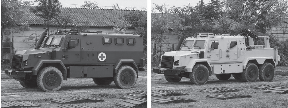
Picture 10. Two separately configured vehicles from the Komondor family. [49]

The Hungarian military industry is already capable of producing vehicles of such protection levels by ordering and purchasing the parts and components from vendors who are in connection with Hungary and are executing their production activities here. [50] [51] The product range of Respirátor Ltd. contains differently configured vehicles as part of the Komondor family. The aim of the first vehicle improvement was the creation of an equipment capable of NBC reconnaissance. [52]