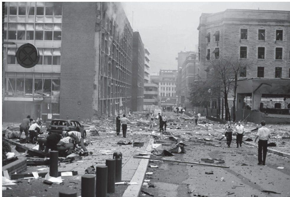
Picture 2. The scene of the explosion in Norway.

In the above example the assassin could have effectively shot at the police officers and ambulance team arriving from the other side.