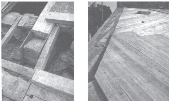
Figure 3. Strengthening the connections with steel ring beams between the wood roof element and the walls. [18]