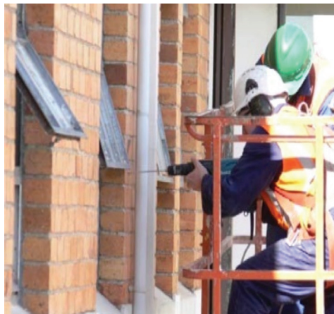
Figure 2. Using steel ties for increasing flexural strength and reinforcing outer structural elements. [19]

structure are anchored from the external walls. This technology prevents the peeling and falling of the outer layer cavity wall. Steel ties were effectively applied for example in Italian and New Zealand retrofitting programs, too. [19] This solution is sometimes implemented by the disconnection and reconnection of adjacent structural elements. Using steel ties has a particularly favourable result on stone masonry buildings. [18]