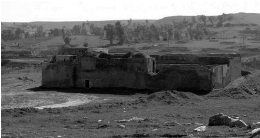
Annex 3. The view of the 1400 years old St. Eliah's monastery in Mosul prior to destruction by ISIS.