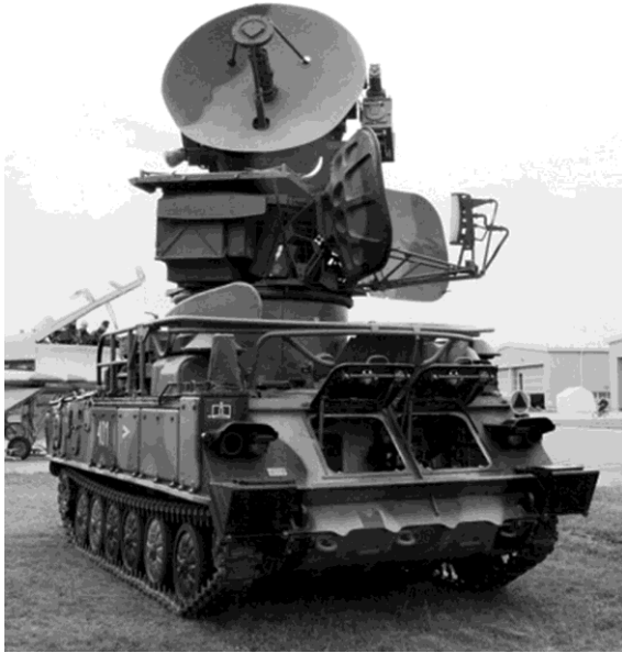
Picture 5. Hungarian Army IS91 Straight Flush. A Polish built WZU-2 day/night optical tracker has been retrofitted on the RHS of the illuminator antenna. [1: 51]