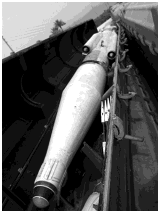
Picture 1. A captured Iraqi 3M9/R-60 hybrid heat seeking Gainful round can be seen. Note the Magnesium Fluoride nose window and ad hoc removal of the fixed nose strakes. [1: 46]

“While the resulting heat seeking 3M9 round would retain similar susceptibility to flares or more recently, infrared jammers, the missile engagement sequence would be devoid of the CW 3 illumination for the terminal phase of the missile’s flight. As a result, the aircraft under attack would only have the command uplink signals and terminal phase IS91 tracking signals to warn of an approaching missile. Where the defensive countermeasures suite relies on the CW signal to trigger angle/Range jamming, the heat seeking 3M9 could be potentially very effective.” [1: 45]