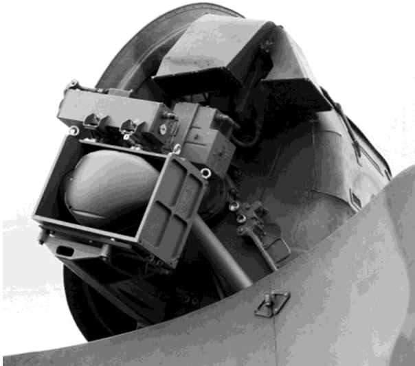
Picture 7. Hungarian Army 1S91 Straight Flush illuminator and optical tracker. [1: 53]