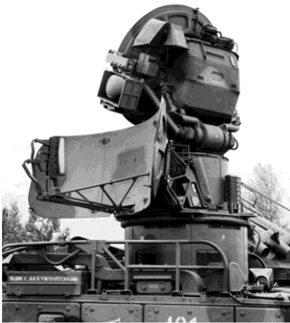
Picture 6. Hungarian Army IS91 Straight Flush. Note the stacked feeds on the search radar. [1: 52]