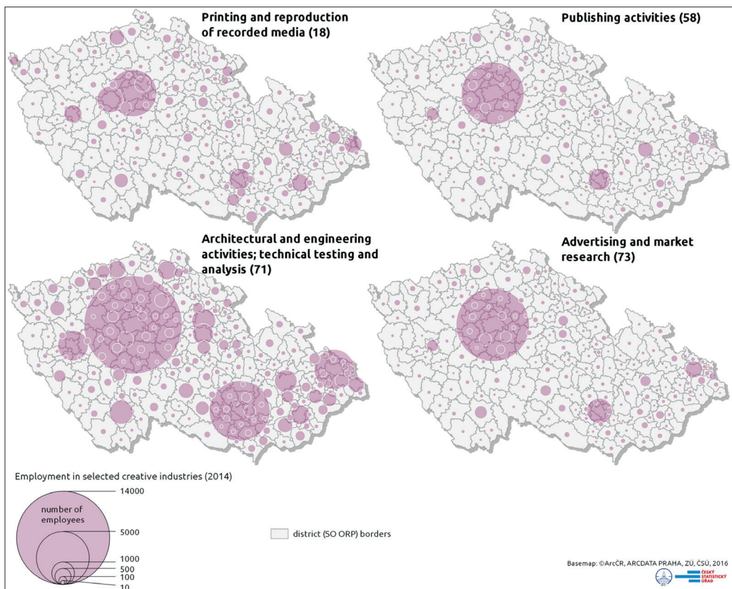
Fig. 3. Spatial distribution of employment in selected CI (2014).

Printing and reproduction of recorded media (industries with significant portion of manufacturing production and technical activities) are by far the most dispersed and significantly represented in metropolitan hinterlands (Beroun, Pohořelice) and some old industrial (Český Těšín) and urban regions (Plzeň, Zlín, Olomouc etc.). Media form the second extreme industries heavily concen-