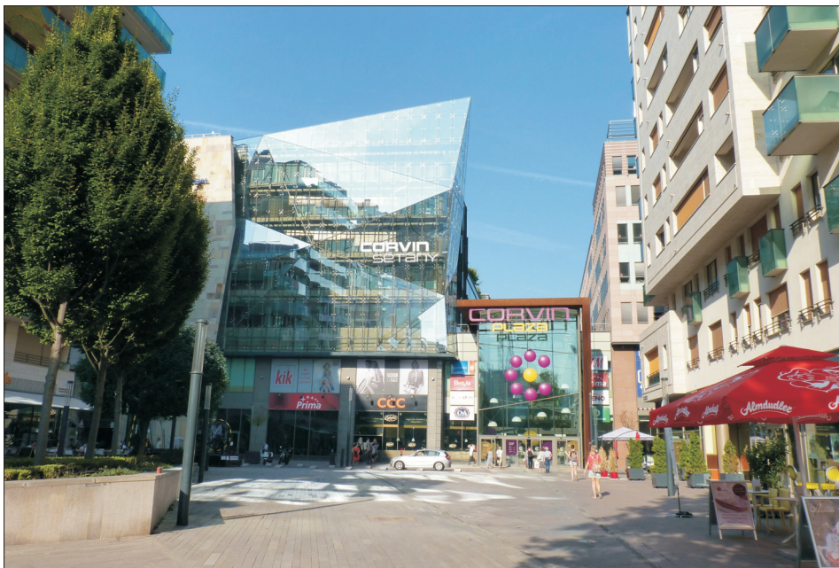
Photo 5. The Corvin Plaza, one of the largest shopping malls in Józsefváros

“The most common problem is the lack of clean places and green areas. (...) There are not enough playgrounds: in Palota Quarter there is only one, in Gutenberg Square”