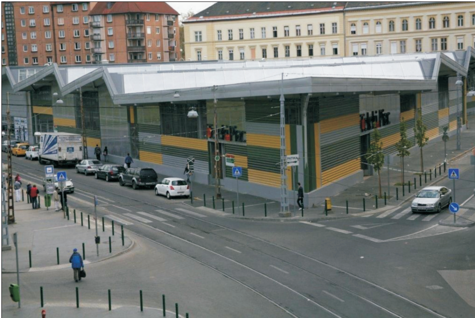
Photo 2. The renewed market at Teleki Square