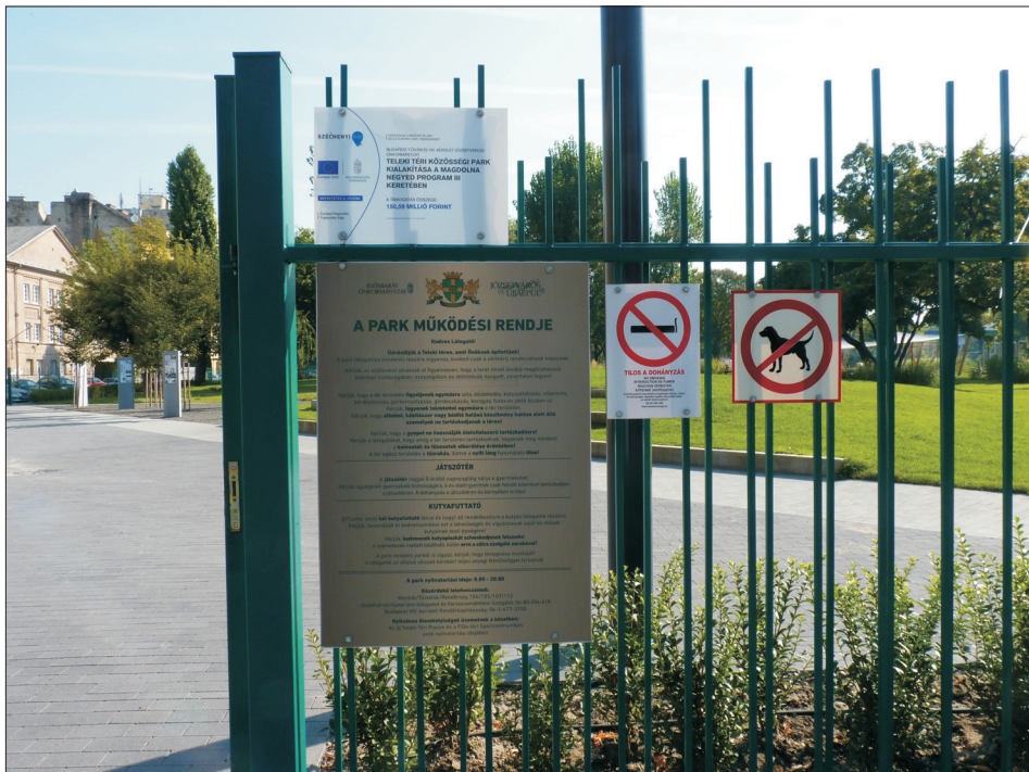
Photo 3. Park regulations at the renewed Teleki Square

On the district level, new rules were also introduced to protect the renovated playgrounds and parks; these defined the time periods of use as well as the appropriate behaviour (e.g. no eating in playgrounds, no sleeping or alcohol consumption in parks etc.) in these places ( Photo 3 ). The renewed parks and playgrounds are often fenced to keep away the unwanted users. In some cases, security guards were also hired to enforce the regulations. The local government of Józsefváros also banned eating the food waste from the trash cans in 2010 because ‘it is unhealthy and dangerous’ [9]. The local government also initiated a referendum in 2011 on begging and homelessness, trying to enforce the previously accepted anti-poor regulations. However, the referendum became unsuccessful, since the voter turnout did not reach the necessary threshold.