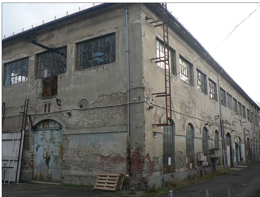
Photo 1. Brownfield area in the Hajógyár Island, Budapest.

Due to deindustrialisation a significant amount of brownfield lands have been produced in Europe since the 1960s and 1970s. After the collapse of communism deindustrialisation also speeded up considerably in post-socialist cities as part of economic restructuring ( Photo 1 ). Problems of brownfield areas have