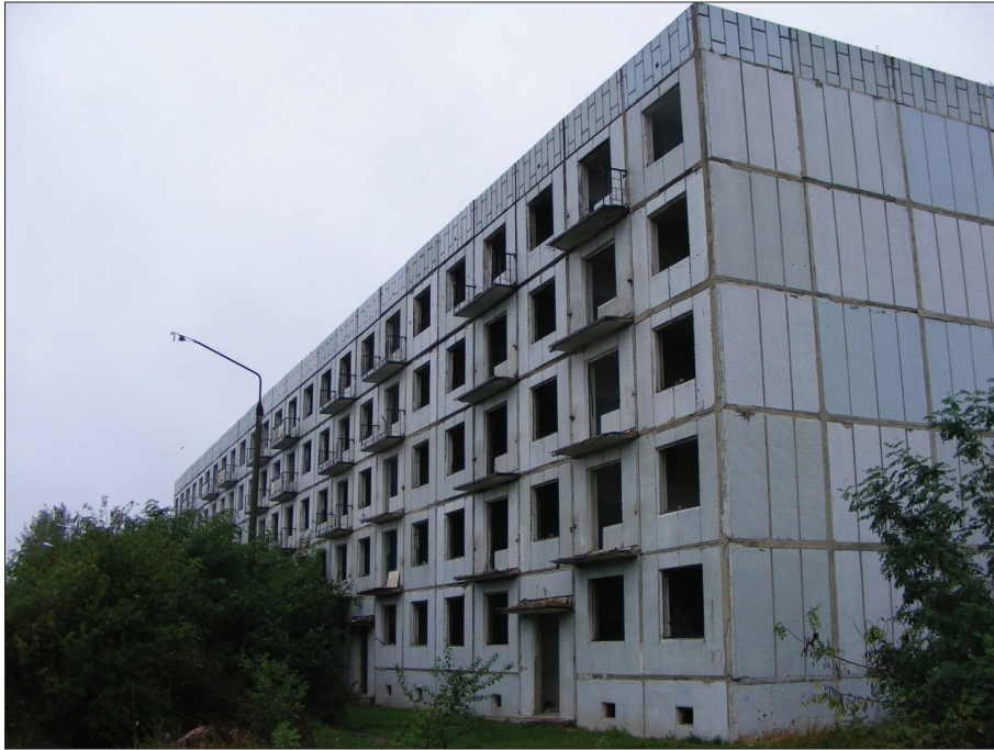
Photo 3. Former Soviet military flats in Szolnok

around 55,000 soldiers and approximately 10,000 civilians on 288 sites, in 104 settlements of Hungary. Based on the research of the National Environmental Remediation Programme made by VITUKI Kht. (NAGY, Á. 2005) 171 former Soviet sites were found in the country. HOMOR (2009) mentions in his book that 100,380 Soviet citizens left the country, including 44,668 soldiers, leaving 94 garrisons vacant. In these garrisons 328 properties were used by the Soviets.