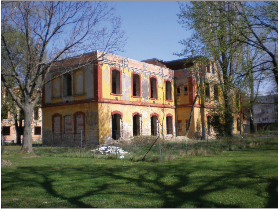
Photo 4. The ruins of a former Soviet kindergarten in Székesfehérvár