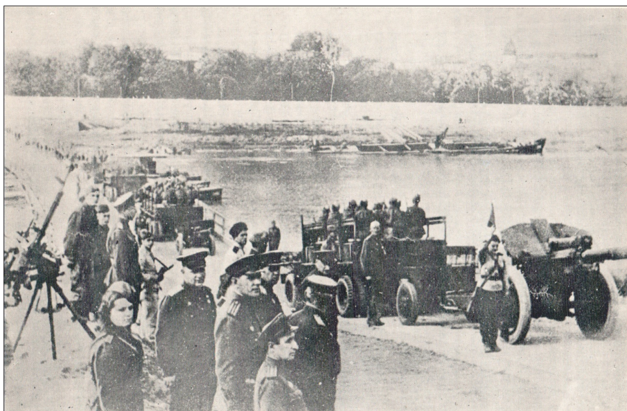
Photo 2. Soviet troops crossing the Tisza river in 1944.

In the first phase of withdrawal the Soviet Army withdrew 22 troops from Hungary: an armoured troop, a descent storming battalion, a chemical protection battalion, a military officer training school and other units (HOMOR, Gy. 2009; HORVÁTH, M. 2003; KÁDÁR, K. 2011b). The number of soldiers stationed in Hungary was decreased by 10,000 soldiers and 4,000 civilians also left the country.